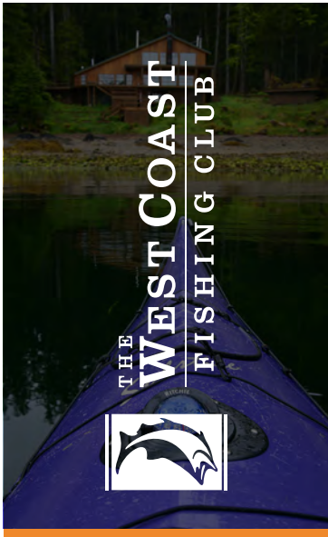
Masset, BC June 23-27, 2024