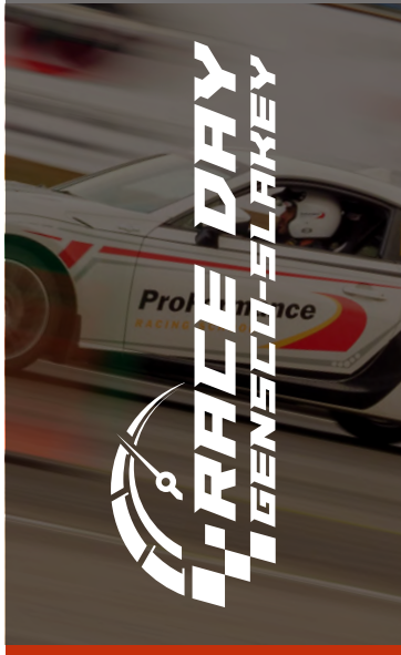
Kent, WA July 25, 2024